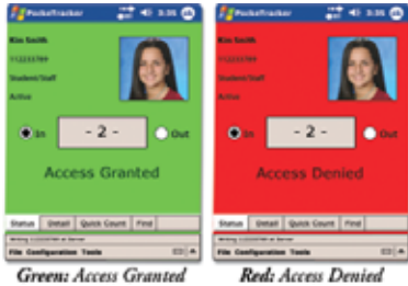
Green: Access Granted