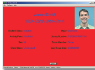
Red: Access Denied

PockeTracker and RapIDTrack Red/Green are powerful and efficient identity management tools that can meet any tracking and verification need. The PockeTracker "Go Anywhere" entry access management system was designed to be easy to use and highly user configurable, while it easily fits in the palm of your hand. RapIDTrack is a desktop version of our tracking software that can be installed on a PC.